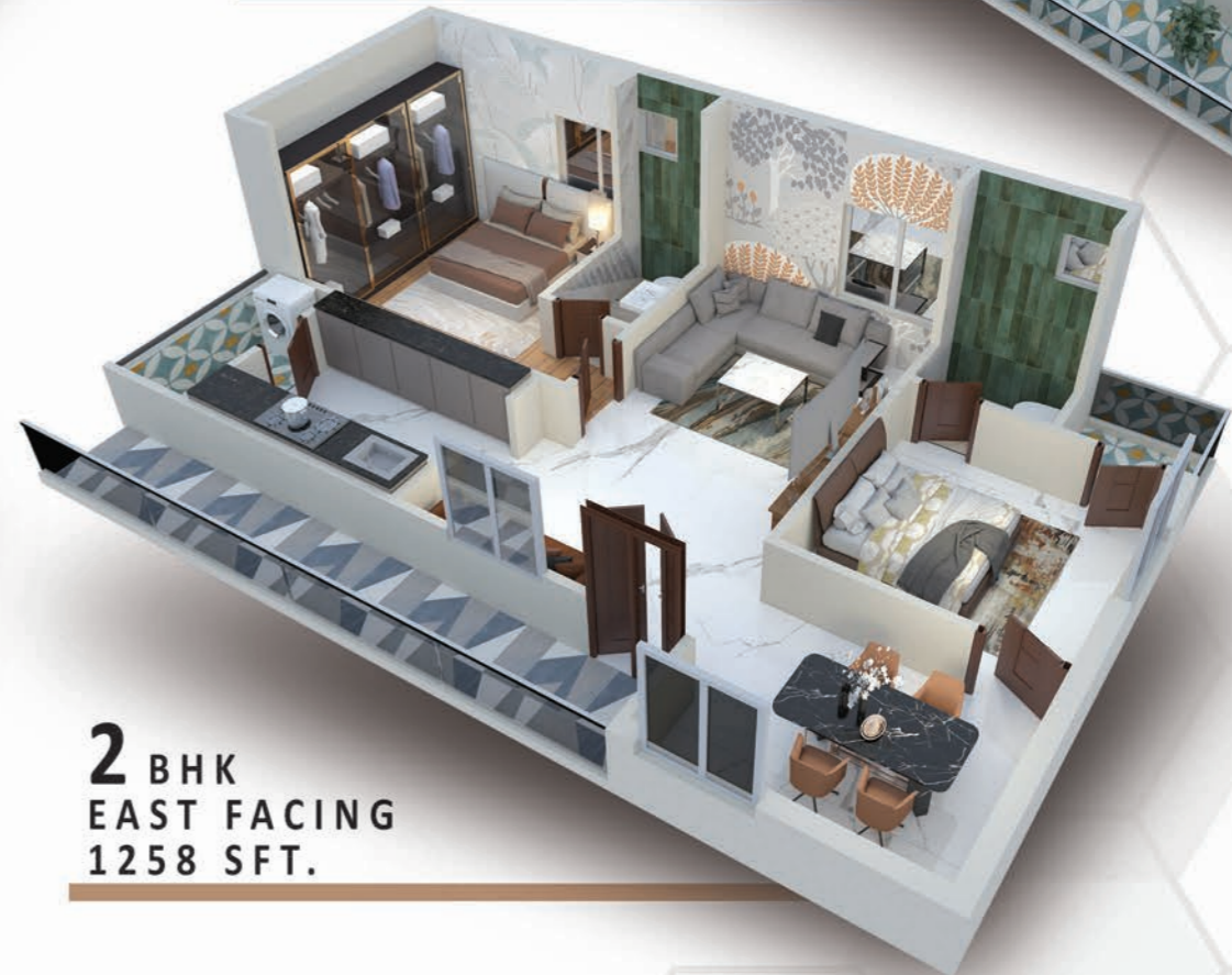
2 BHK EAST FACING 1258 SFT.