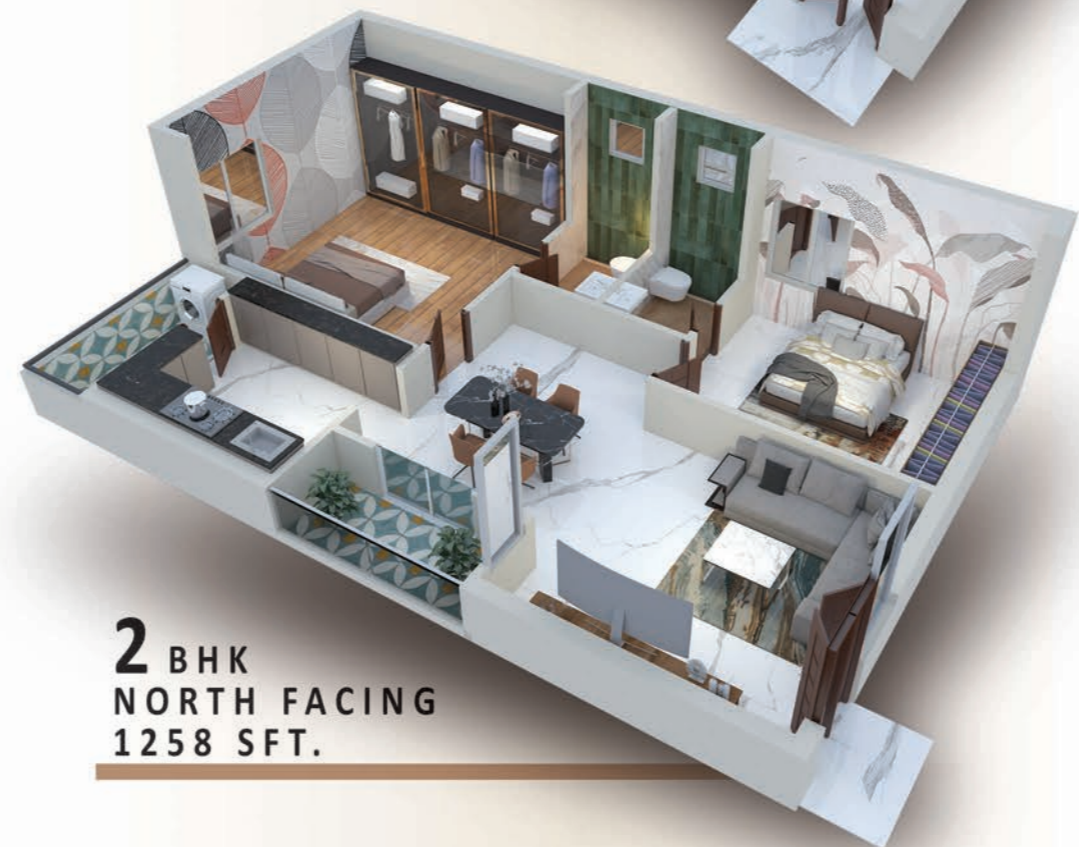
2 BHK NORTH FACING 1258 SFT.